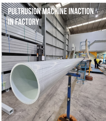
PULTRUSION MACHINE IN ACTION IN FACTORY