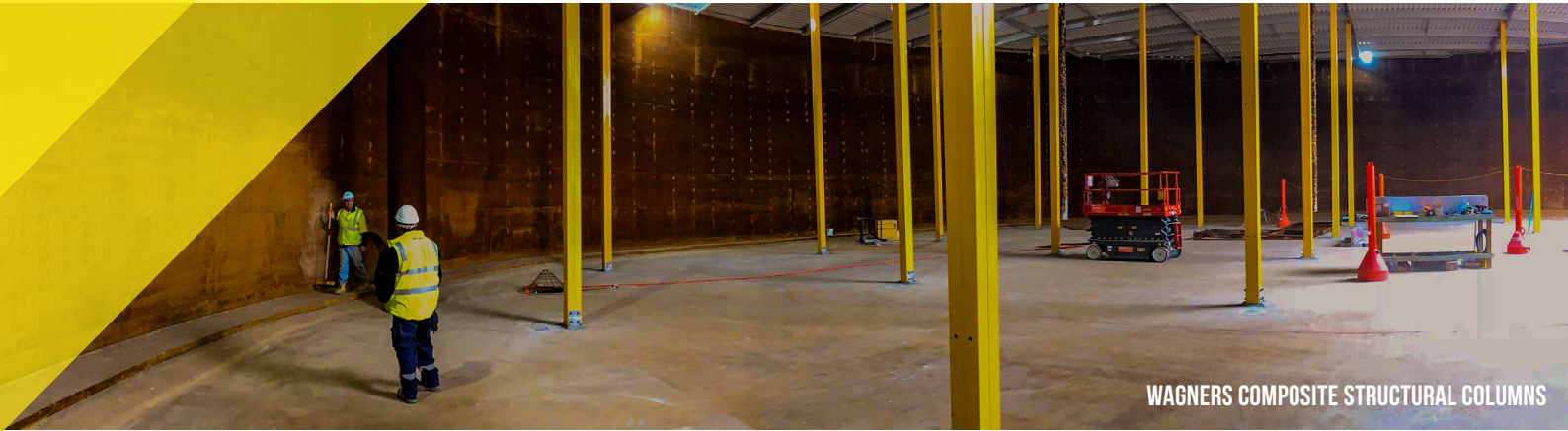
WAGNERS COMPOSITE STRUCTURAL COLUMNS